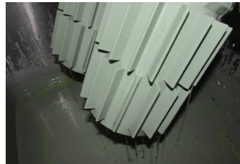
SUSPENDASLURRY ZR material & cobalt aluminate

gallon SUSPENDASLURRY ZR drum next to their prime tank. The operator opens the drum, remixes the material and dips only those parts requiring the more expensive zircon application.